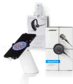
SECURITY & MERCHANDISE