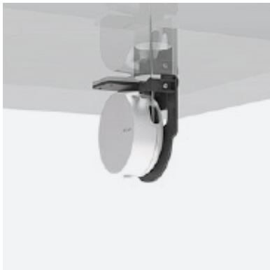
Retractable Cable Recoiler