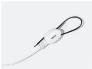
Locking Loop Sensor