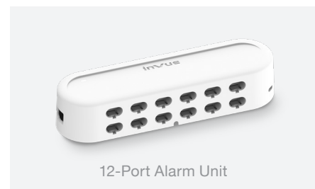
12-Port Alarm Unit