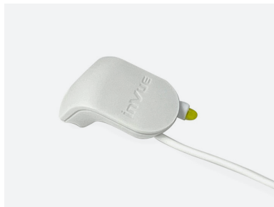
Adjustable Loop Sensor