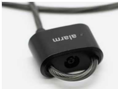
High Security Adjustable Loop Sensor