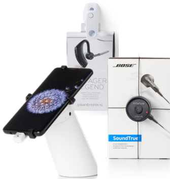
Security & Merchandise