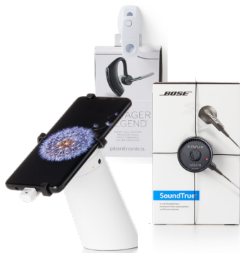
Security & Merchandise