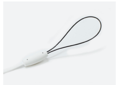
Non-Adjustable Loop Sensor