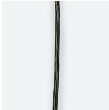
High-Security Steel Cable