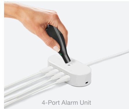
4-Port Alarm Unit