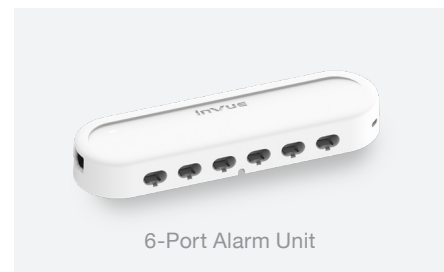
6-Port Alarm Unit